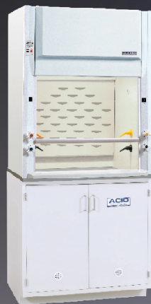
UniFlow CE AirStream