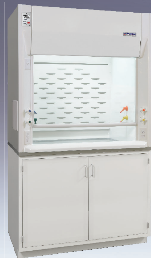
UniFlow LE AirStream