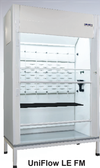
UniFlow LE FM